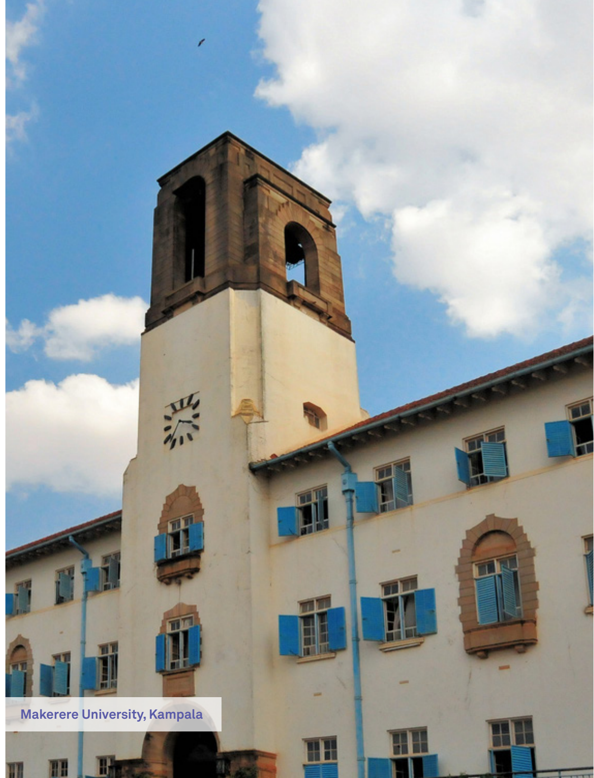
Makerere University, Kampala

"We all extend our heartfelt gratitude to donors, friends, well-wishers, and partners... who make such incredible journeys possible."